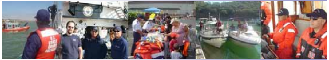
U.S. Coast Guard Auxiliary - District 11NR, Division 5, Flotilla 2